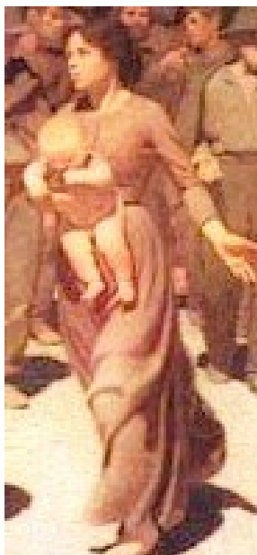
Volpedo's II QuadroStato (the Proletariat) was painted in 1900.

Details of Scottish events and Readers and Supporters groups www.morningstarscotland.org